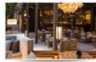
Zerruco, The Ashoka, Delhi -2014