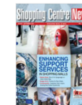
Sep 24, 2014 Shopping Centre News August-