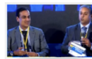
INTEGRATED PROJECTS - THE NEW MANTRA: OP... India Shopping centre Forum -2014