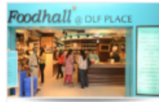
Foodhall, DLF Place Saket, New Delhi -2014