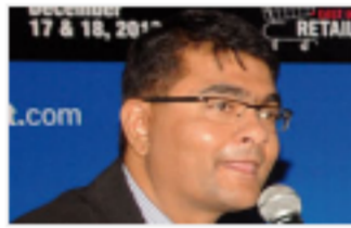
EIRS_Conf 2013 East India Retail Summit -2013