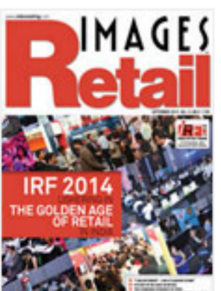
Sep 24, 2014 Images Retail September 2014