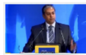
ISCF 'FOUNDATION SESSION': RETAIL REAL E... India Shopping centre Forum -2014