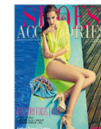
Sep 24, 2014 Shoes & Accessories