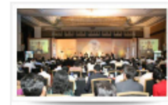
FGFI Food and Grocery Forum India -2012