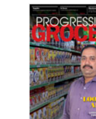
Sep 24, 2014 Progressive Grocer Septembe