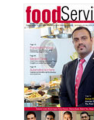
Sep 24, 2014 Food Service September-