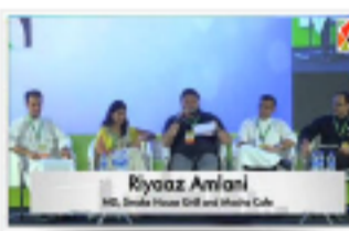
DEVELOPING INDIAN FOOD PALATE TO INTERNA... India Food Service Fourm -2014