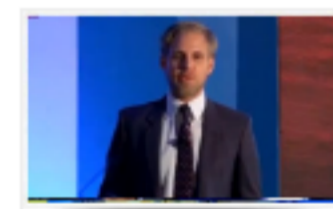
THE TWO-WAY SYNERGY BETWEEN MALLS AND RE... India Shopping centre Forum -2014