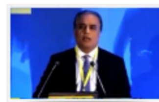
INAUGURAL SESSION AND KEYNOTE ADDRESSES -... India Shopping centre Forum -2014