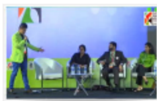
ROLE OF F & B IN BUILDING THE HALL MARK ... India Food Service Fourm -2014