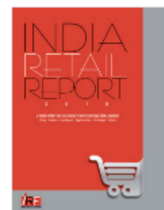
Dec 31, 2014 India Retail Report 2015